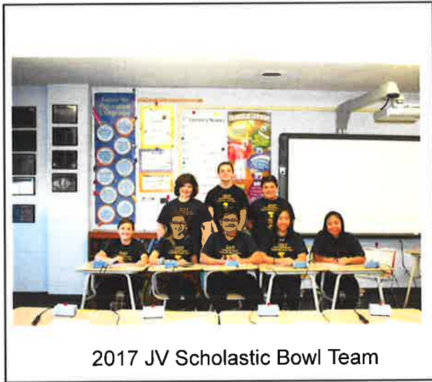
2017 JV Scholastic Bowl Team