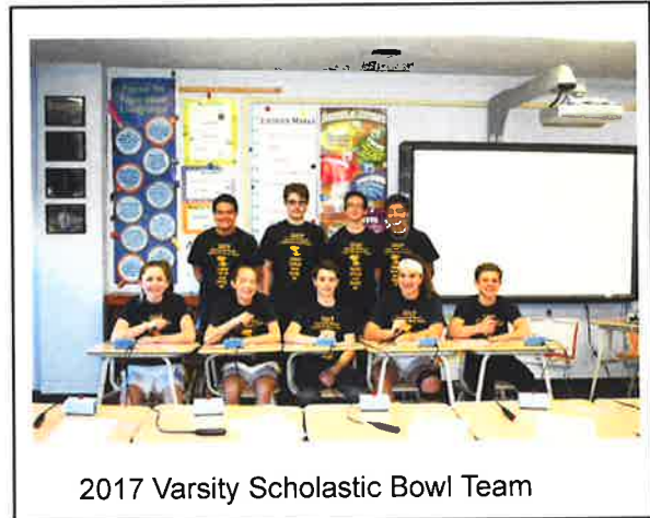
2017 Varsity Scholastic Bowl Team

Scholastic Bowl is known as the sport of the mind. Formerly known as "Quiz Bowl," it is a game that uses the brain more than the body. The way the game is played is that there are two teams and they go head to head against each other. Both teams have buzzers and a tossup question is asked. If someone thinks that they know an answer, they will buzz in and answer the question. If they get the question right, their team will have control of three bonus questions. If they get the the toss up question wrong, the other team has 5 seconds to answer.